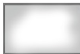
Without DUE: uneven brightness distribution

Uniformity errors usually seen as brighter or darker areas on the screen are characteristic of LCD panels. A Digital Uniformity Equalizer (DUE) function corrects brightness and chroma uniformity errors so they are virtually unnoticeable.