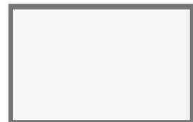
With DUE: uniform brightness across the screen